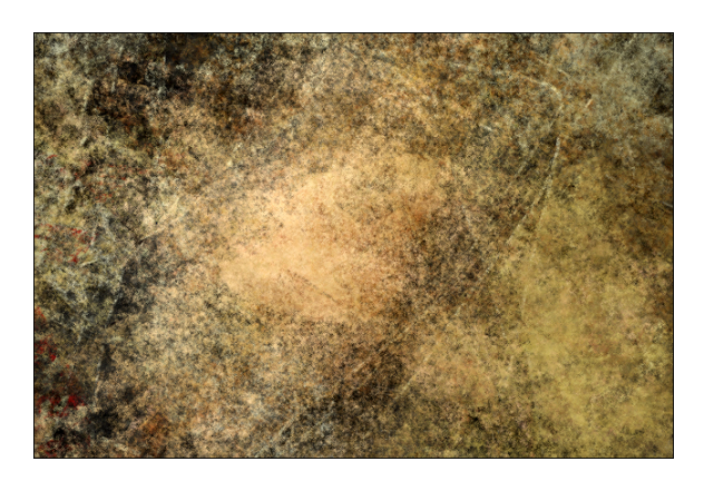
Figure 7: Abstracted image made from ten different images of a reclining nude figure.

of producing novel, high-quality artistic renderings. In doing so we demonstrated the power of biologically inspired models and metaphors to create new forms of artist expression. Furthermore, the simple implementation and effective results produced by our system makes a compelling argument for more research using swarm-based multi-agent systems for non-photorealistic rending.