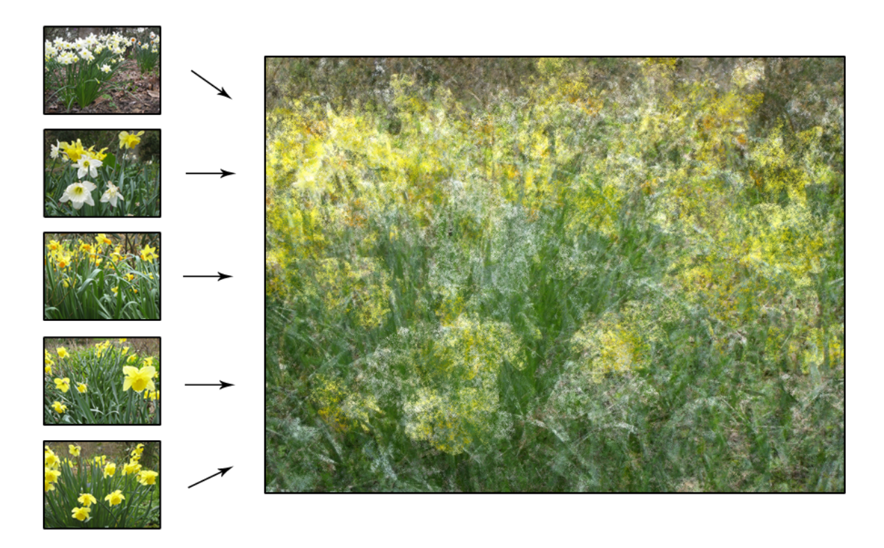
Figure 3: 'Aesthetic ideals' (left images) for five different groups of Aesthetic Agents and the output (right image) their interaction produces.