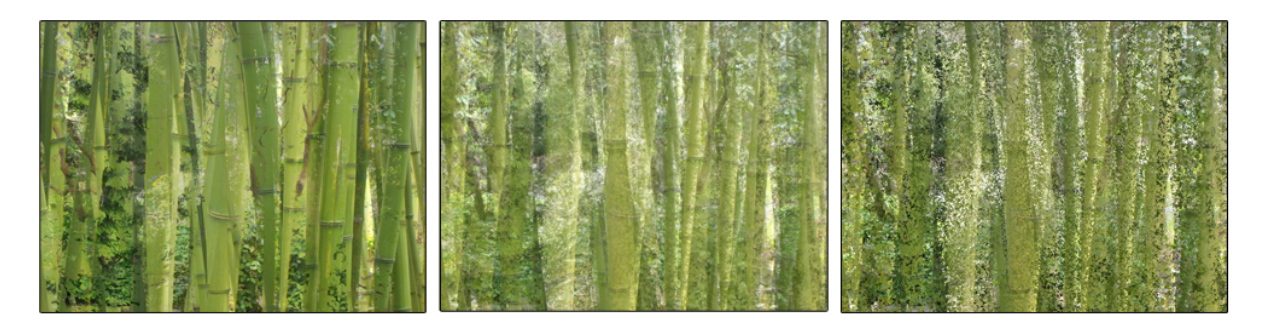
Figure 1: Demonstration of the effect of different interpolation values. Interpolation values from left to right are 0.01, 0.1, 0.9