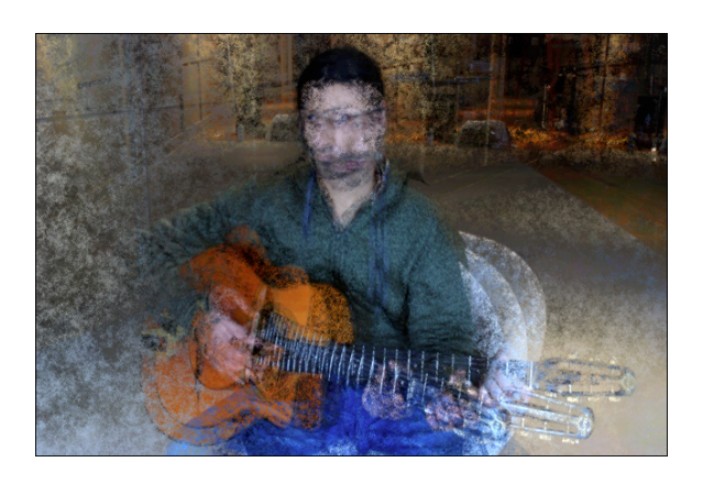
Figure 6: Image created using successive frames of a subject in motion in conjunction with camera translation.

the non-moving parts of the image remain photorealistic. One way to get around this is to combine the translation of the camera (like in our Cubist inspired experiments) with the movement of the subject. Figure 6 demonstrates a sample output using this hybrid approach.