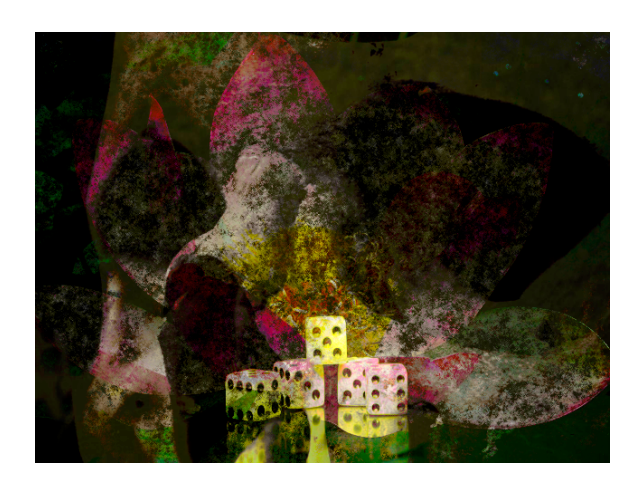
Figure 2: Montage created by assigning different groups of Aesthetic Agents an image of a skull, a lotus flower, and dice.

Since our system uses multiple images the most obvious visual technique to explore was montage. Montage (French for 'putting together') is a composition made up of multiple images. The technique played an important role in many Modern Art movements including Bauhaus, Dada, Constructivism, Surrealism, and Pop Art. To create a montage we simply take n images and assign each one to a different group of Aesthetic Agents . Figure 2 shows a montage made of an image of a skull, a lotus flower, and dice.