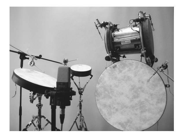
Figure 1 . The experimental setup for our robotic based frame drum experiments. In the foreground, three frame drums are shown with solenoids placed to ensure optimal striking of the drum surface. In the background of the picture, the control system is shown.

proper monitor setup has experienced. However this ability is conspicuously absent in existing music robots. One could remove the acoustic drum actuated by a solenoid so that no sound would be produced and the robotic percussionist will continue "blissfully" playing along.